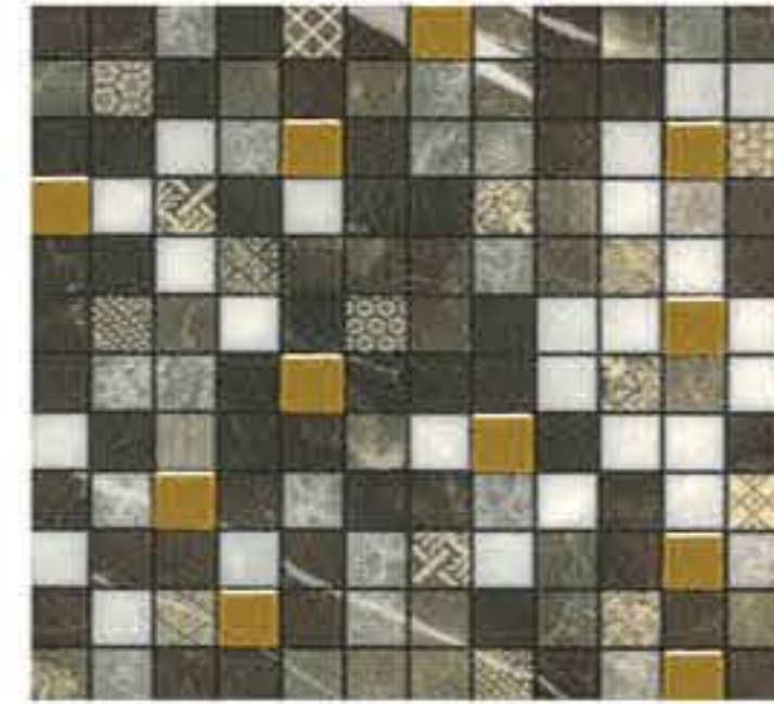
Ivory Mosaic A 30x30